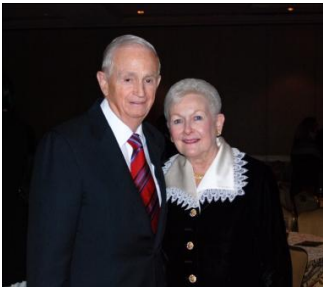
lt to rt: Mr. J.W. Marriott and Mrs. Marriott